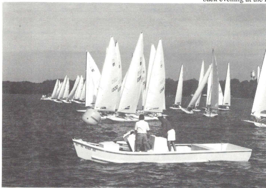
First Race Friday morning, Mid-Winter Championships

Winds ranged from 15-22 with bigger gusts and were out of the west on Thursday and Friday, and from the north on Saturday. Olympic courses were used throughout. Here are some comments by some of this years participants: